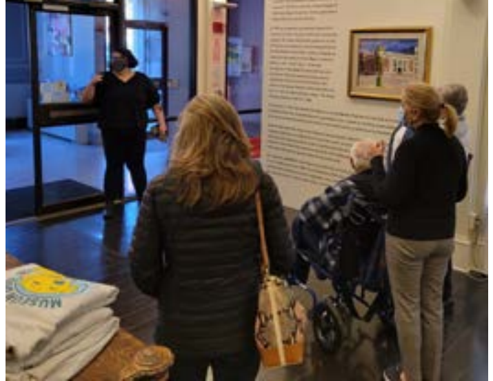
CREATIVE CARE FILED TRIP

NBAM is located in the beautiful Seaport Cultural District in historic downtown New Bedford. Please consider visiting the Art Museum at 608 Pleasant Street. NBAM presents a rotating schedule of exhibitions, workshops, and digital experiences as a local cultural institution and is open Thursday through Sunday from 10 AM - 4 PM. Advanced booking is preferred. Visit newbedfordart.org/visit to schedule your timed tickets and stay connected with NBAM on Facebook and Instagram (@nbam_aw) .